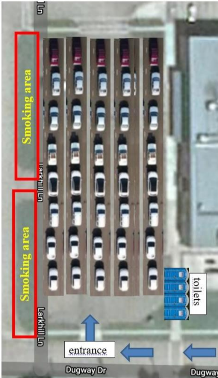
Morning Registration parking lot (Ralston, AB)

Visit: https://mywildalberta.ca/hunting/hunting-draws/cfb-suffield-elk-hunt.aspx